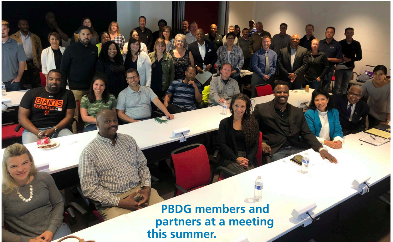
PBDG members and partners at a meeting this summer.

Partners, MBEs, GCs: Please notify us at info@PBDGweb.com with any subcontracting notifications, or if you need time on the agenda