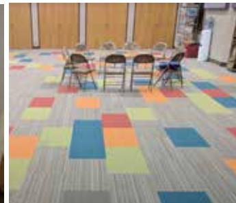
Some recent examples of Techsource's work

In their early years, the business was focused on remodeling and restoration. For the past eleven years they have been in the commercial flooring industry. They are CoBid certified MBE/ESB.